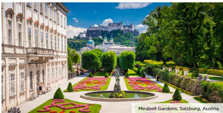
Mirabell Gardens, Salzburg, Austria

Reserve by March 31 st , 2024 to save $1,000.00 pp on your cruise fare.