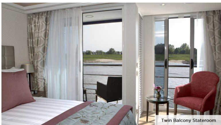
Twin Balcony Stateroom

7-night cruise | October 16-23, 2024 | Aboard AmaSonata