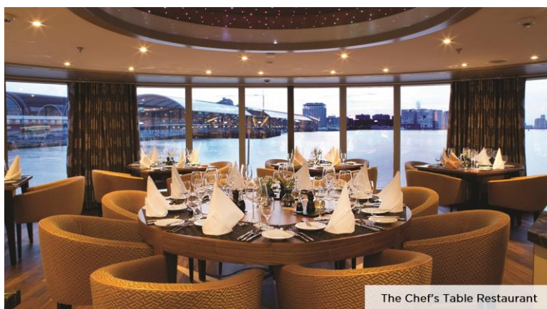
The Chef's Table Restaurant